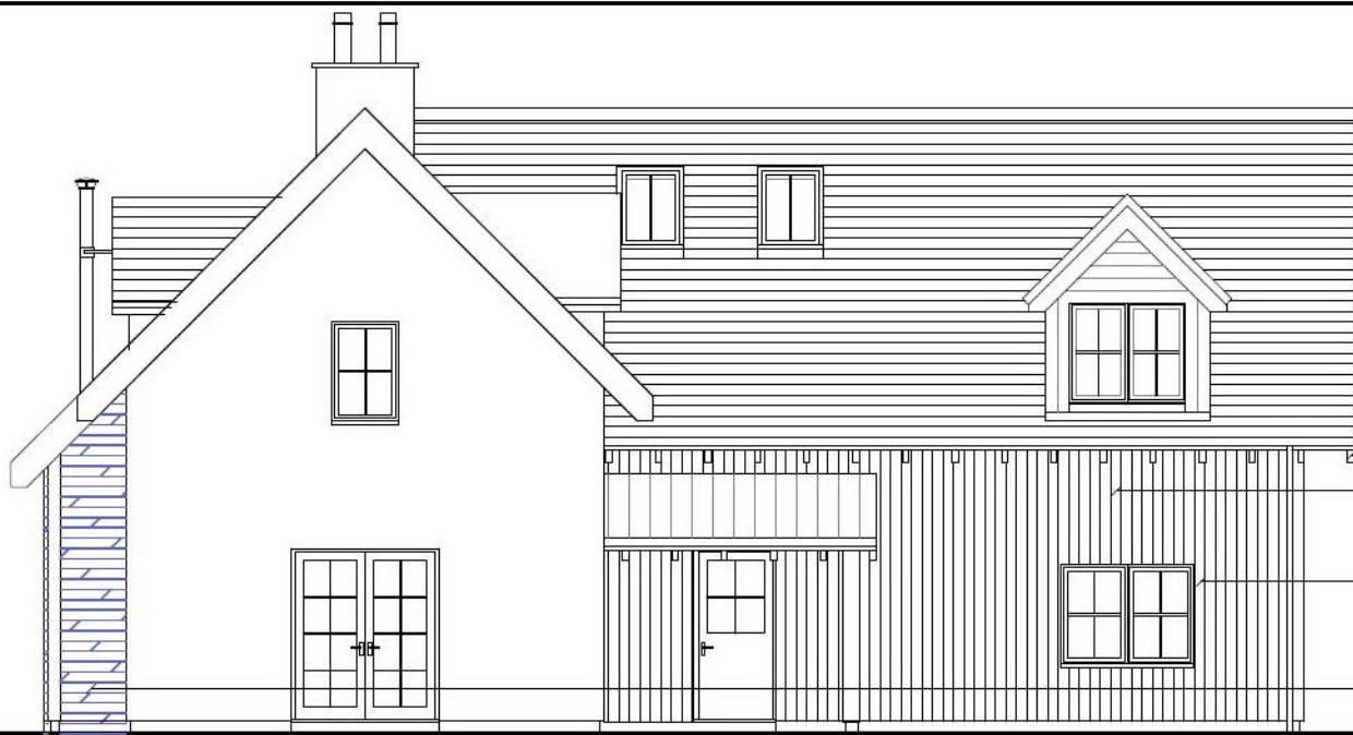
South Elevation 1:100

Job No. 507 Drawing No. L-01 Revision No. A