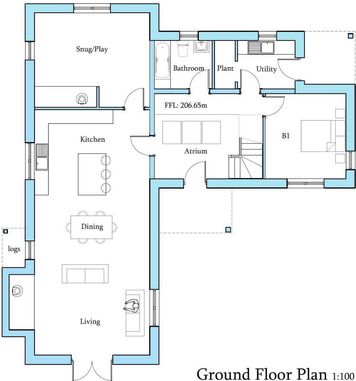
Ground Floor Plan 1:100