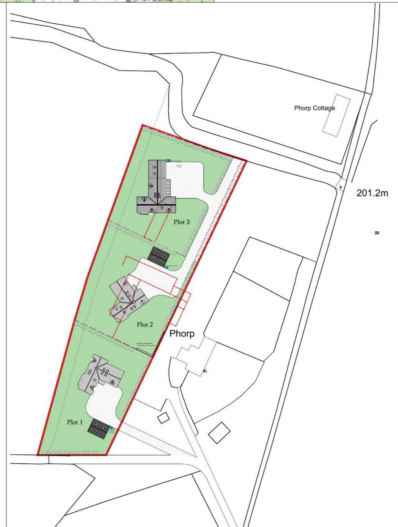
Proposed Block Plan 1:1000